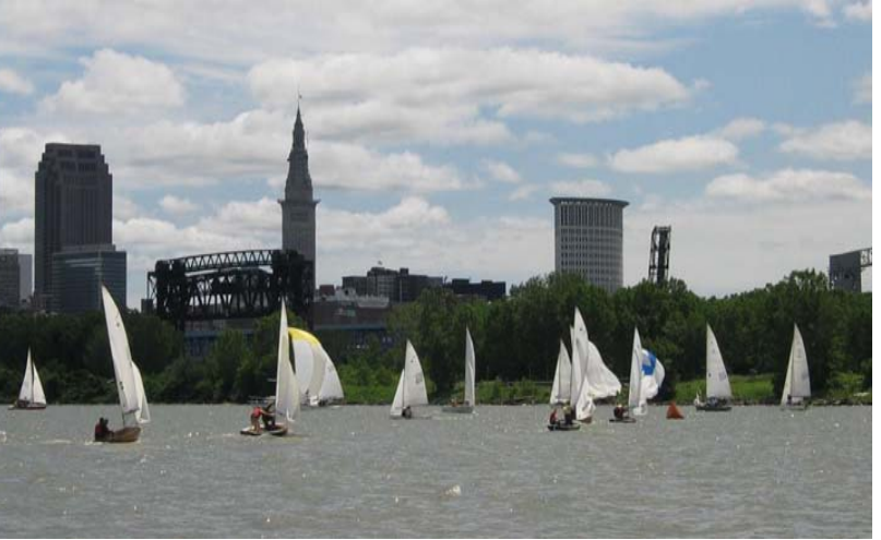
Cleveland Race Week 2004 Lake Erie