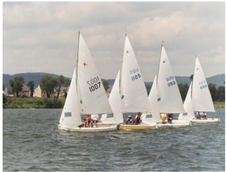
Tight racing at the 2004 Atlantic Coast Champs