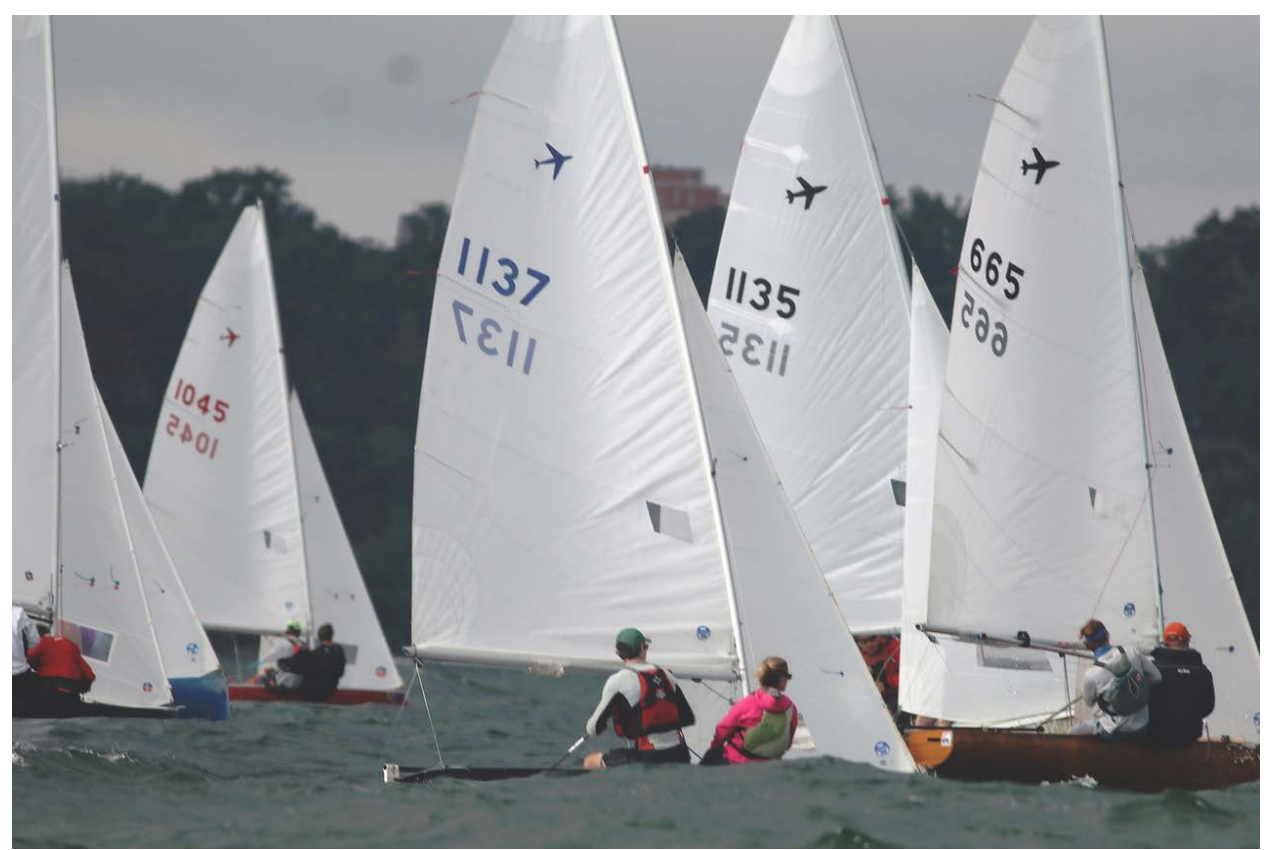
Above: Team Bark (#1137) and Gemperline (#665) look for an opening upwind on Day 3 of the 2017 Jet-14 Nationals at Edgewater Yacht Club.

Brent Barbehenn (Cooper River Yacht Club, NJ) and Sara Paisley won the 63<sup>rd</sup> Jet-14 Nationals in dominant fashion at Edgewater Yacht Club near Cleveland, OH in a variety of conditions. The first two days featured mostly light to moderate breezes out of the south, providing light chop and pleasant racing. Racing was interrupted on Day 2 by an ominous looking shelf cloud and a