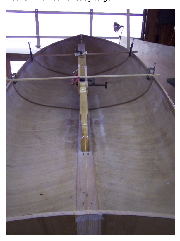
Above: The keel is ready to go in.